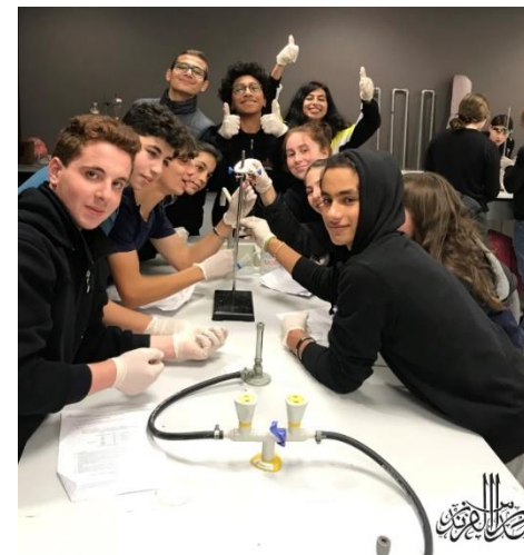
10th Grade MYP students experiment in the Biology lab

One of the key features of MYP is that it aims to contextualize student learning by connecting what content to Global Contexts.